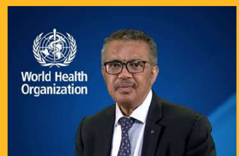
Tedros Adhanom Ghebreyesus Director-General - WHO

"I envision a world in which everyone can live healthy, productive lives, regardless of who they are or where they live. I believe the global commitment to sustainable development – enshrined in the Sustainable Development Goals – offers a unique opportunity to address the social, economic and political determinants of health and improve the health and well-being of people everywhere. Achieving this vision will require a strong, effective WHO that is able to meet emerging challenges and achieve the health objectives of the Sustainable Development Goals. We need a WHO – fit for the 21st century – that belongs to all, equally. We need a WHO that is efficiently managed, adequately resourced and results-driven, with a strong focus on transparency, accountability and value for money."